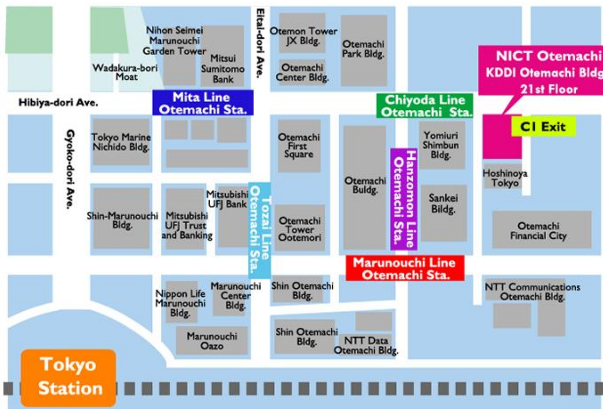
Access from Otemachi metro sta. to NICT Otemachi

The building has direct access from Otemachi metro station "EXIT C1" via underground passage